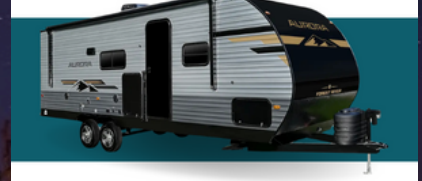
AURORA 21BH BUNKMODEL