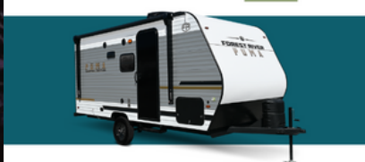
PUMA 122BHCE BUNKMODEL