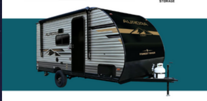
AURORA 15RBX COUPLES COACH