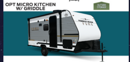
PUMA 18RKX COUPLES COACH