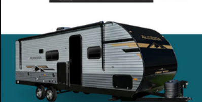
AURORA 26BH BUNKMODEL